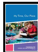
My Time, Our Place; Framework for School Age Care in Australia 2022 V2